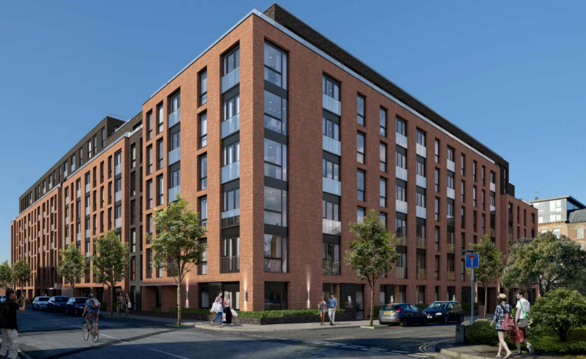
Former Hicking Pentecost, Crocus Street – Phase 2