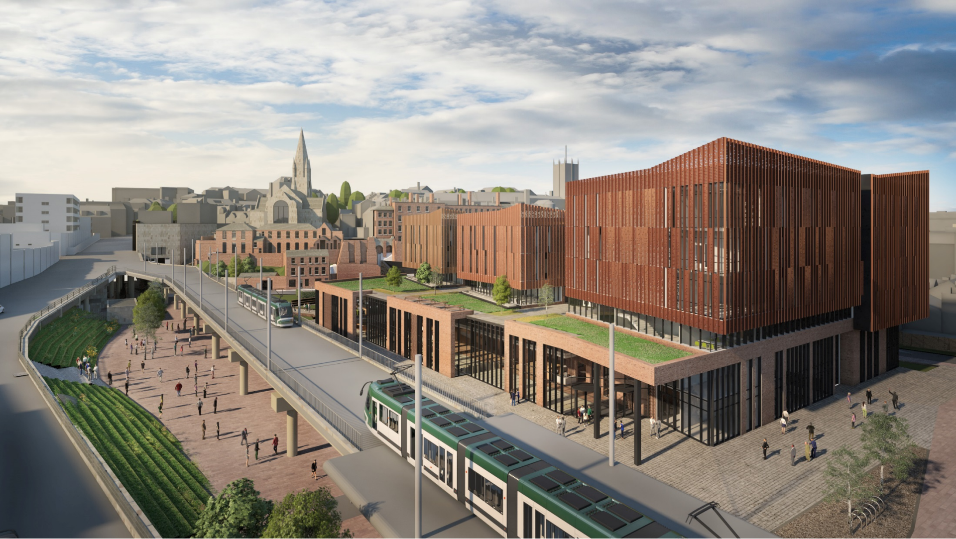
Nottingham Skills Hub