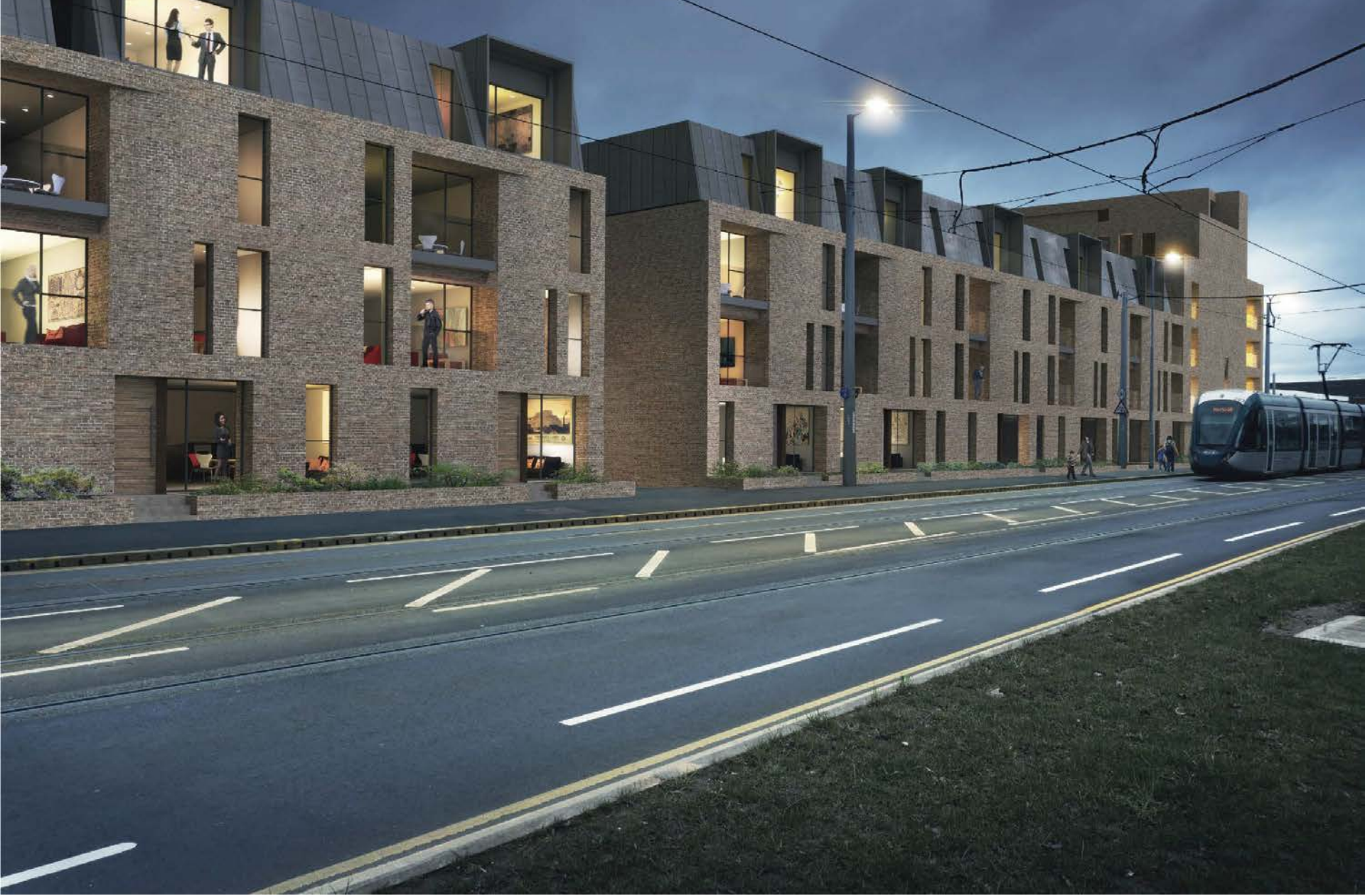
Crocus Street - Cresswell Site