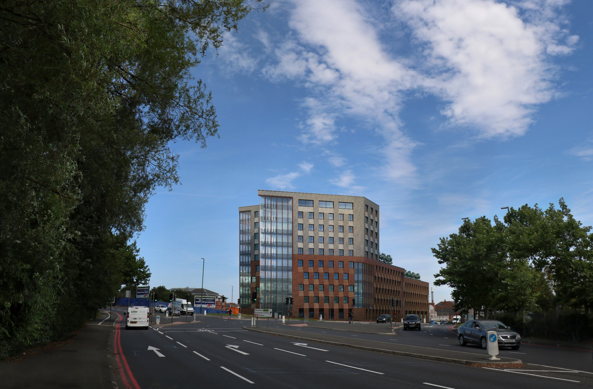
The Vantage - Waterway Street West