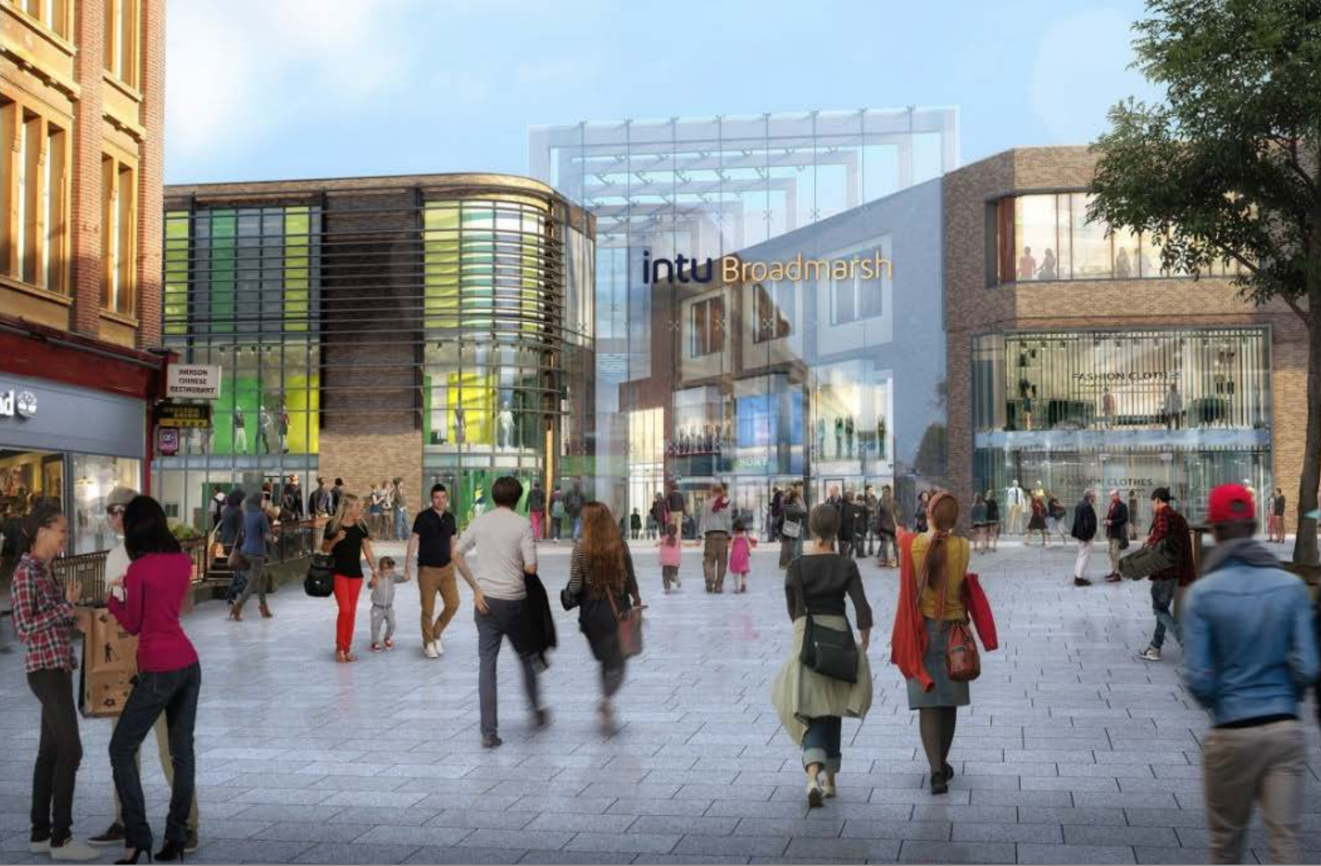
Intu Broadmarsh Shopping Centre