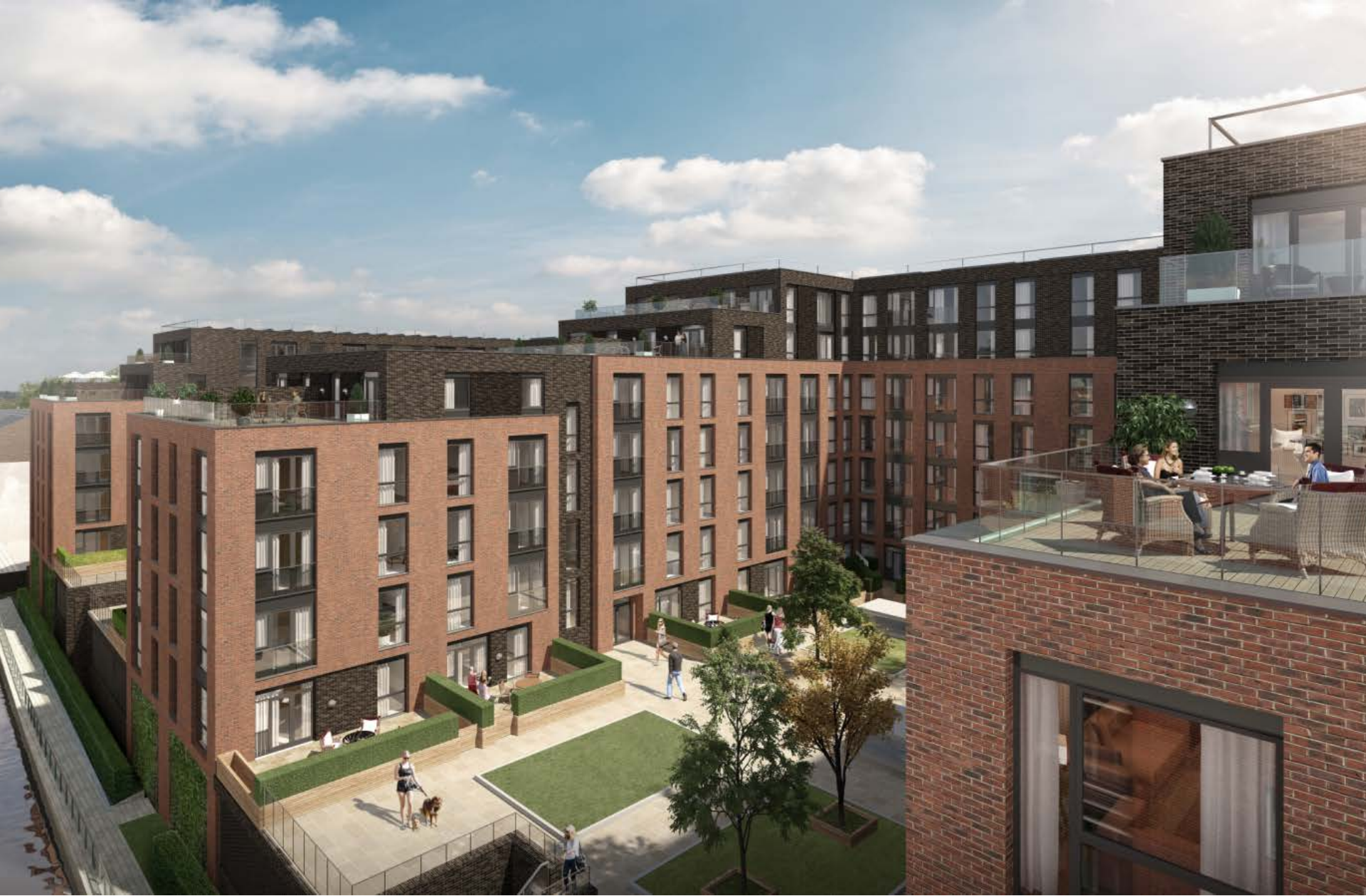
Former Hicking Pentecost, Crocus Street – Phase 2