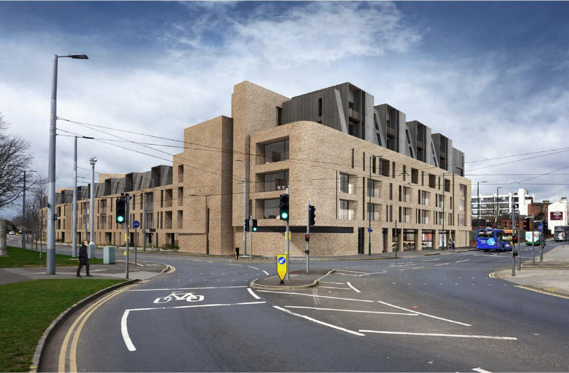
Crocus Street - Cresswell Site