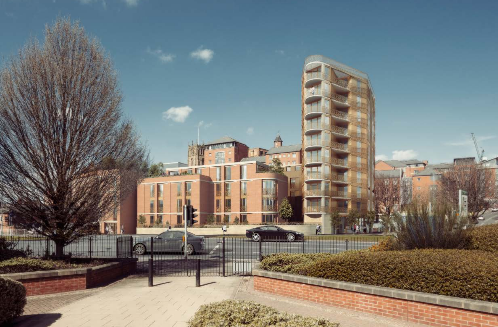
London Road – Former PFS Site